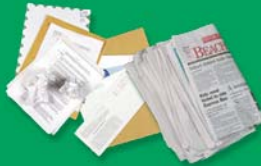
Mixed Paper, Newspaper, Office paper, & Junk Mail