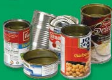
Metal Food & Beverage Cans