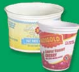
Wide-mouth Plastic Containers