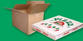
Cardboard Boxes & Pizza Boxes

Please empty and rinse all containers before placing in recycle cart.