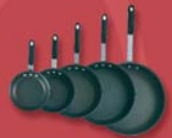
Pots & Pans