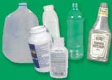
Plastic Bottles & Jugs #1-7 (with lids)