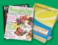
Magazines, Phone Books & Catalogs