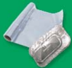
Aluminum Foil & Trays