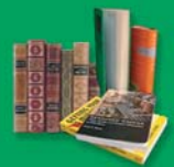
Paperback & Hardcover Books