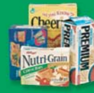
Cereal & Food Boxes