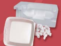
Styrofoam Cups, Plates, Bowls, To Go Containers