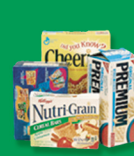
Cereal & Food Boxes