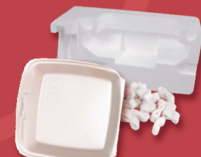
Styrofoam Cups, Plates, Bowls, To Go Containers