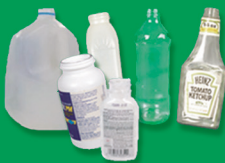
Plastic Bottles & Jugs #1-7 (with lids)