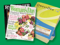
Magazines, Phone Books & Catalogs