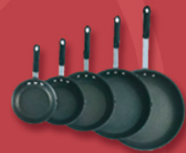
Pots & Pans