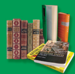
Paperback & Hardcover Books