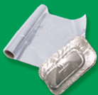
Aluminum Foil & Trays