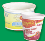
Wide-mouth Plastic Containers