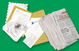
Mixed Paper, Newspaper, Office paper, & Junk Mail