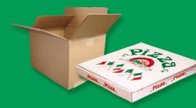
Cardboard Boxes & Pizza Boxes

Please empty and rinse all containers before placing in recycle cart.