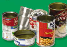
Metal Food & Beverage Cans